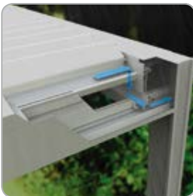
Efficient concealed water drainage