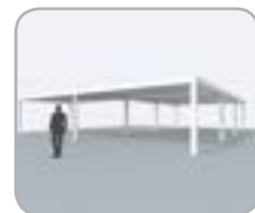
Multiple parts joinable on the pivot and span side