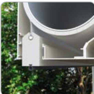
Integrated sun protection screen: the bottom bar disappears into the box