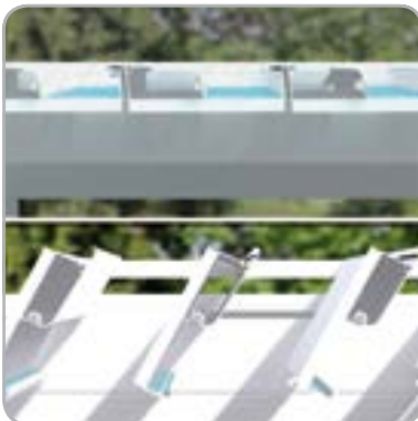
Controlled water drainage, even when the blades are opening