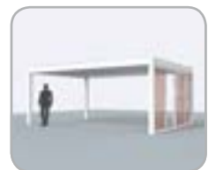
Span side equipped with Loggiaiwood® or Loggiascreen® 4FIX