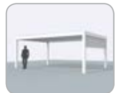
Span side equipped with integrated Fixscreen®