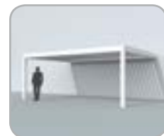
Fitted to an outside wall (2 columns)