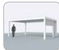
Pivot and/or span side equipped with integrated Fixscreen® and sliding door using Loggiascreen® 4FIX or Loggiaiwood®