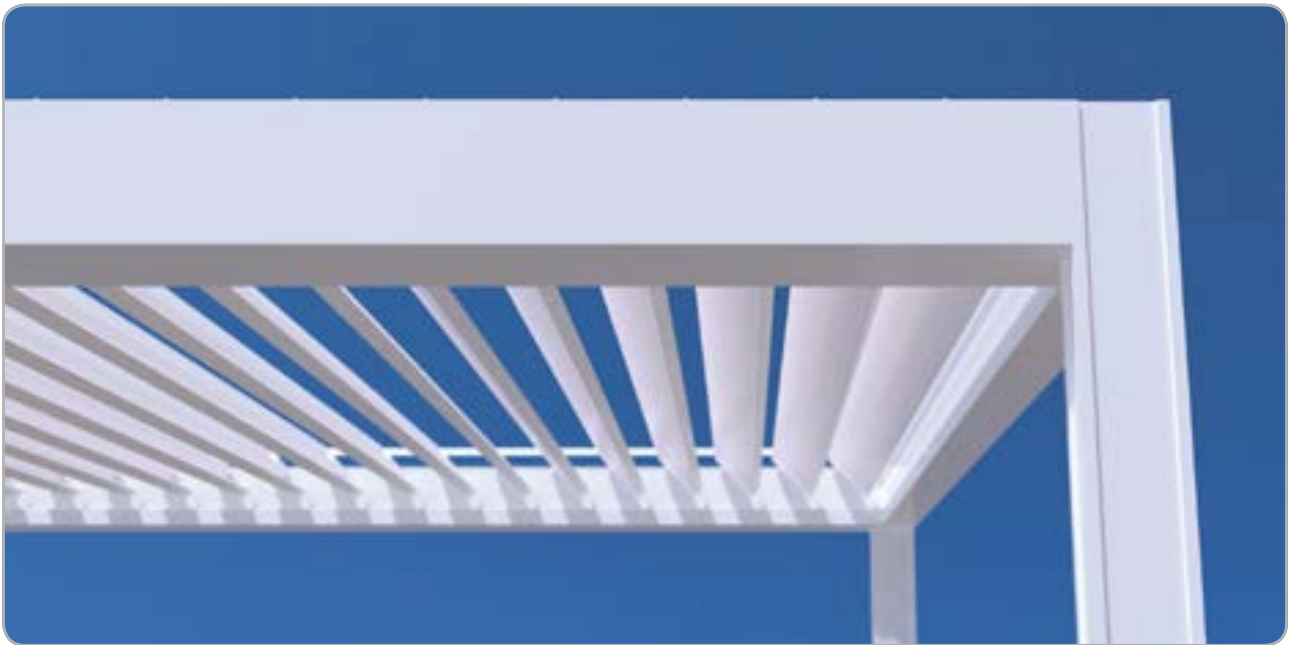
In open position: adjustable sun protection and ventilation