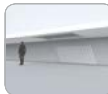
Integration: built into an existing opening