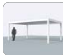
Stand-alone (4 columns)