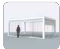
Pivot and/or span side equipped with glass sliding walls whether or not combined with integrated Fixscreen®