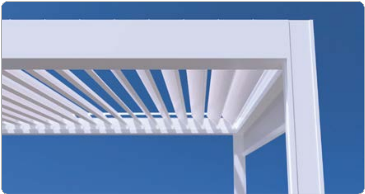
Integrated vertical windresistant sun protection screen based on Fixscreen® technology