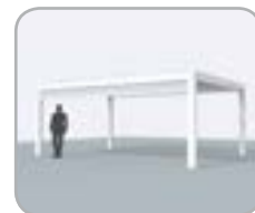
Pivot side equipped with integrated Fixscreen®

A different look & feel can also be achieved by integrating the Loggiascreen® 4FIX & Loggiaiwood® sliding panels. Loggiascreen® 4FIX can be fitted with the same screen fabric as the vertical screens. There is also the option of creating a warm & cosy feeling by fitting Loggiaiwood® sliding panels with WRCedar sections. They are just the perfect solution for creating sliding doors.